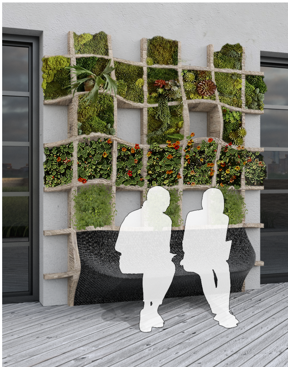
Student green wall design for Vice Media headquarters in Brooklyn